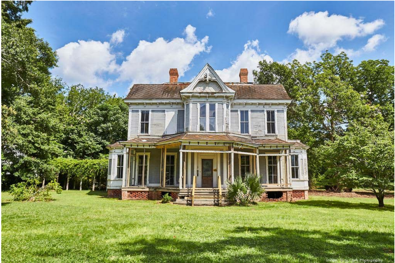
The Foster-Thomason-Miller House. GEORGIA TRUST FOR HISTORIC PRESERVATION