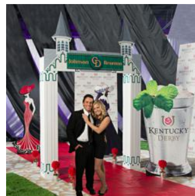
Kentucky Derby Party Decor

The Madison-Morgan Conservancy does it big in Madison, Georgia with “Derby Day.” This event not only includes a Kentucky Derby race watching activity, but a live horse race of its own. Guests dine on a traditional Derby supper, raise money for charity by purchasing items